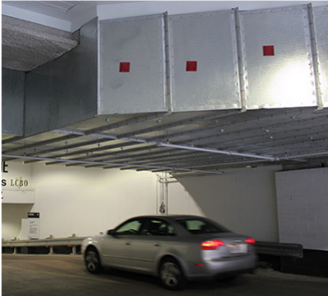
DuraDuct HP plenum.