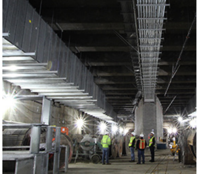
Large DuraDuct HP installation in a subway system.