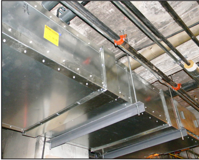
DuraDuct KEX installation.