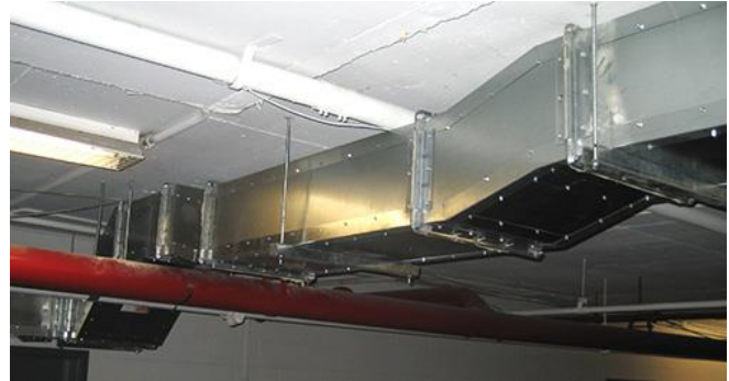
DuraDuct™ GNX installation in an underground parking garage.