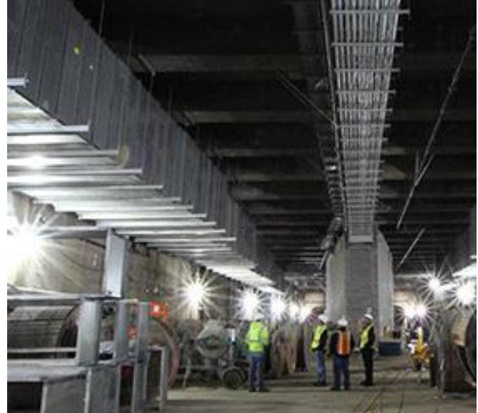
Large DuraDuct™ HP installation in a subway system.