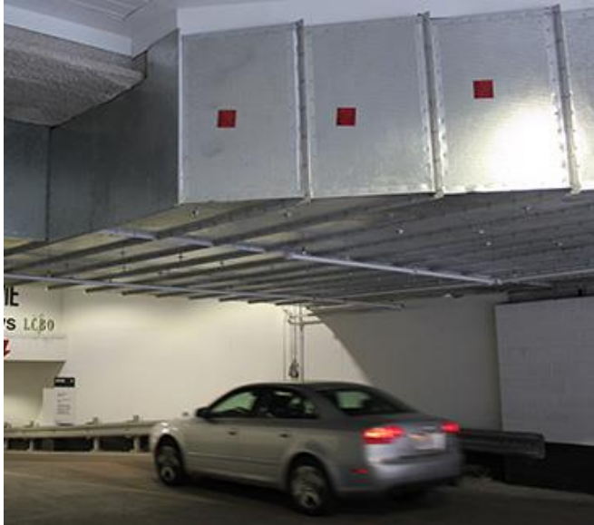
DuraDuct™ HP plenum.