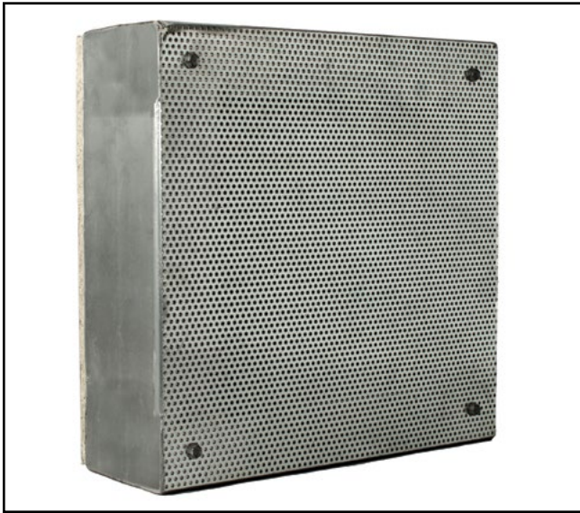
The perforated side of the Absorption Panel.